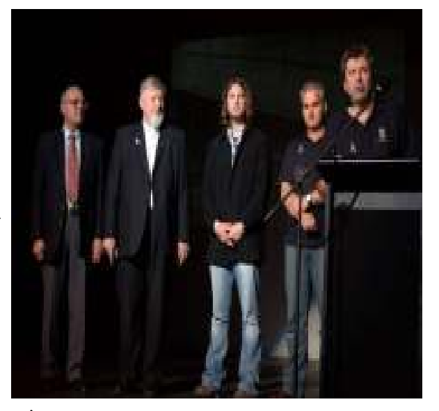
$5,815 was collected from ticket sales. Thank you to the audience who gave their support by coming to the concert!!

We extend a special thank you to the Moonee Valley City Council and Clocktower Centre staff in helping make this event possible.